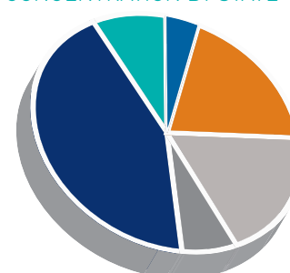
CONCENTRATION BY STATE*