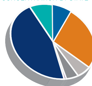
CONCENTRATION BY STATE*