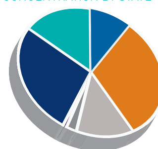
CONCENTRATION BY STATE*