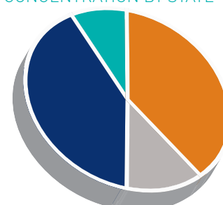
CONCENTRATION BY STATE*