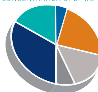
CONCENTRATION BY STATE*