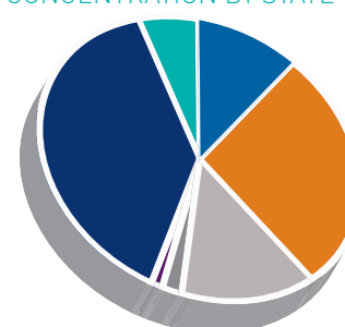
CONCENTRATION BY STATE*