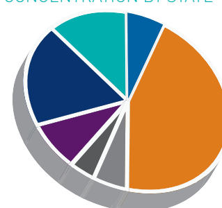
CONCENTRATION BY STATE*