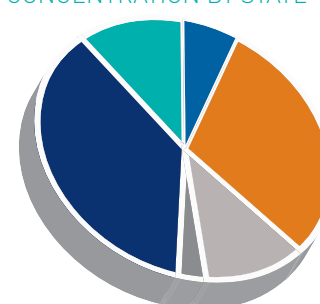
CONCENTRATION BY STATE*