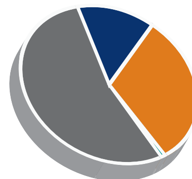
CONCENTRATION BY STATE*